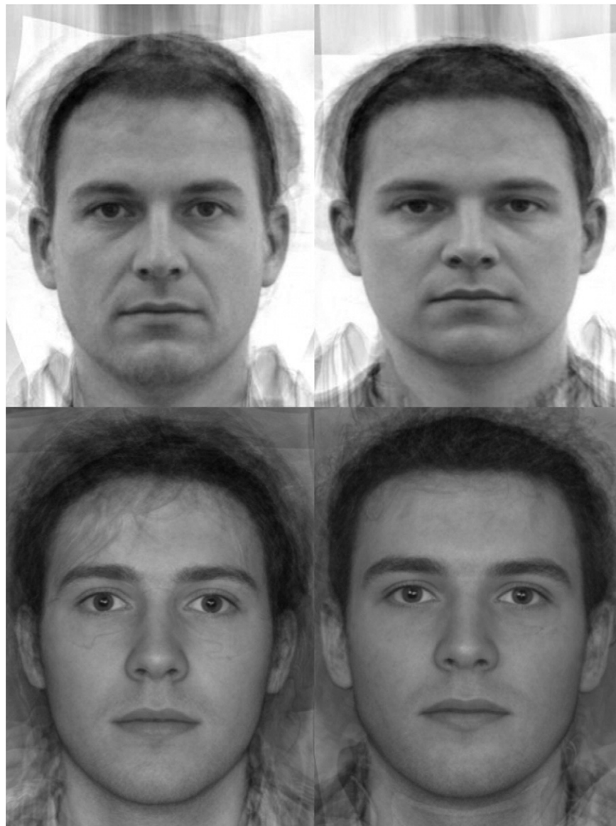
Fig. 3. High and low testosterone averages of each sample. Averages of the twenty men with lowest (left) and highest (right) testosterone levels in Sample 1 (top) and Sample 2 (bottom).

Two fWHR data points more than two standard deviations from the mean were removed, leaving 90 cases. All other facial measures were normally distributed with no outliers. There was no association of testosterone with either age ( r = -.06 , p = .60 ) or BMI ( r = -.05 ,